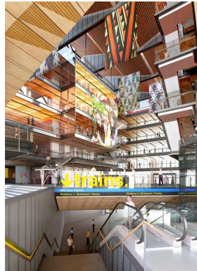
Stage 3 Artists Impression of Atrium Entry to Rail Platforms