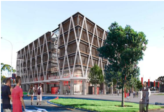
Stage 3 Artists Impression of Integrated Interchange / Campus Building