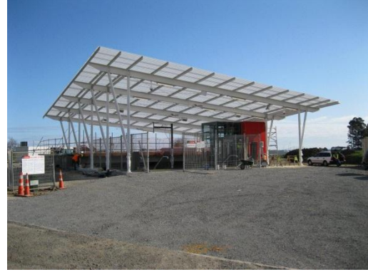
Stage 2 Interim Concourse Canopy