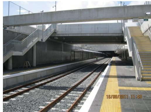
Stage 2 Platforms Fitout