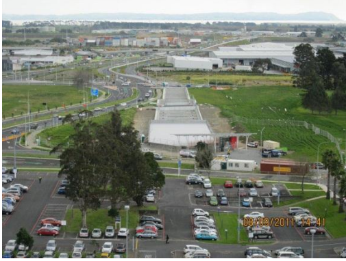
Aerial View of Manukau Rail Link